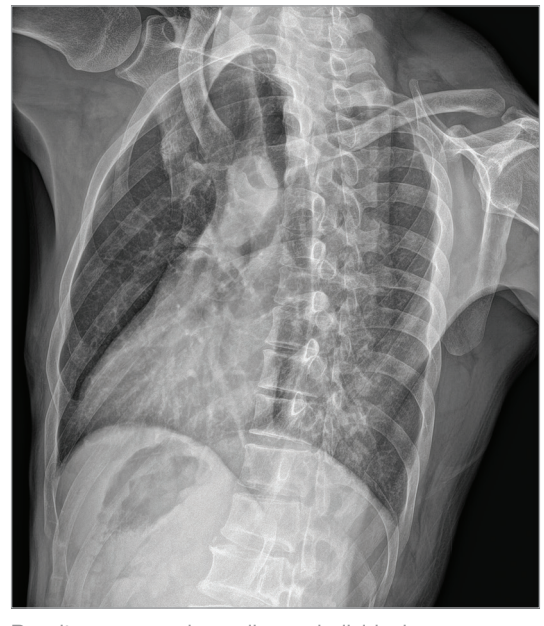
Results may vary depending on individual use.