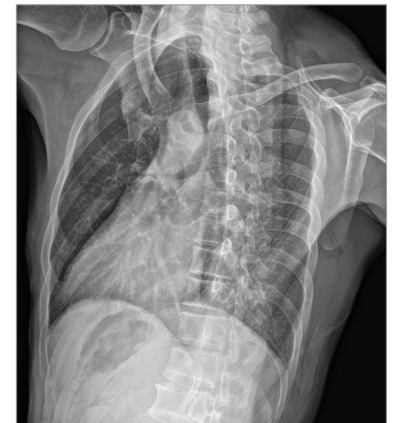
Results may vary depending on individual use.