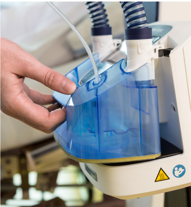
One-hand operation and enhanced ergonomics

The unique combination of having all connections on a humidifier in one single breathing set provides the highest level of ergonomics. Operate the humidifier, change breathing circuits, and replace the water chamber with just one hand. With no need to worry about extra cables to connect or disconnect anymore, you only need to slide the water chamber into the humidifier and connect the breathing circuit to the patient.