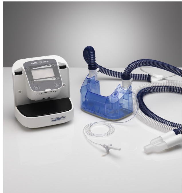
Humidifier station with breathing set including temperature probe, wall-heated breathing circuit, water refill tube, Y-piece, and water chamber